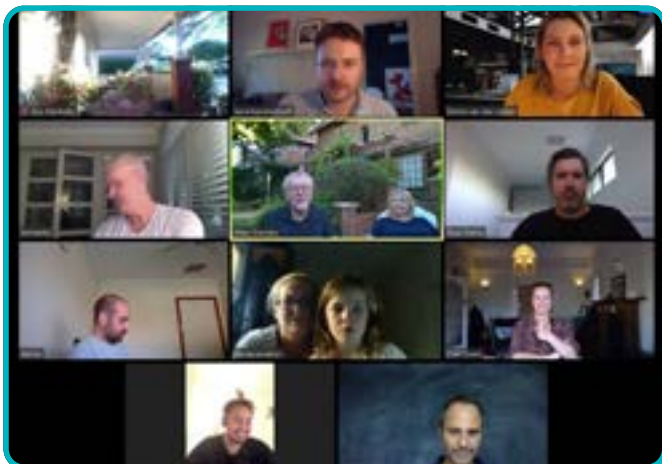
Web Workshop Platform: Zoom