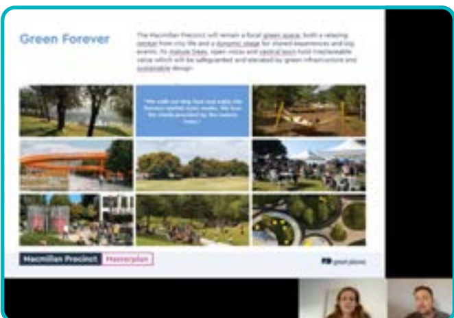
Webinar Platform: Recording