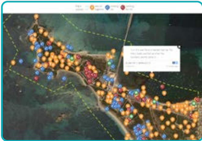
Ideas Map Platform: SocialPinpoint