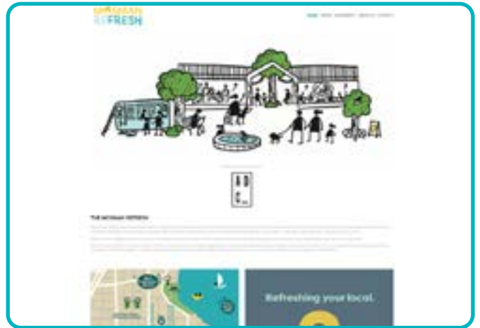
Project Website Platform: Wordpress