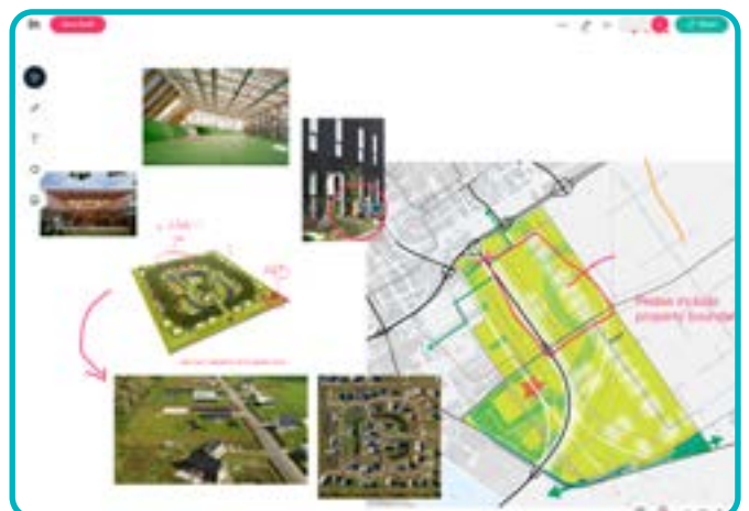
Design Collaboration Platform: Whiteboard